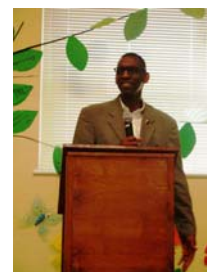
Mayor Jeffery Jones

Our adult education classes in English as a Second Language, GED examination preparation, Computer skills and Workplace Readiness skills are absolutely key to Oasis' mission of giving a hand up out of poverty to the women and children of Paterson.