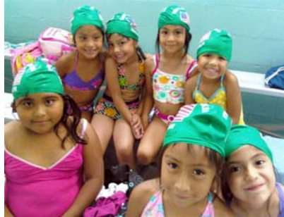
Ready for a swim